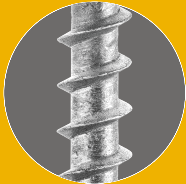
#12 Deep Thread Shank